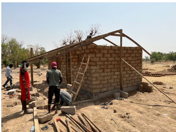
Mudbrick shelter in Adamawa State

Nine ETT reports were published within the reporting period. The reports provide regular updates on the scale of displacement and quantify the affected population, helping partners and agencies respond to immediate needs.