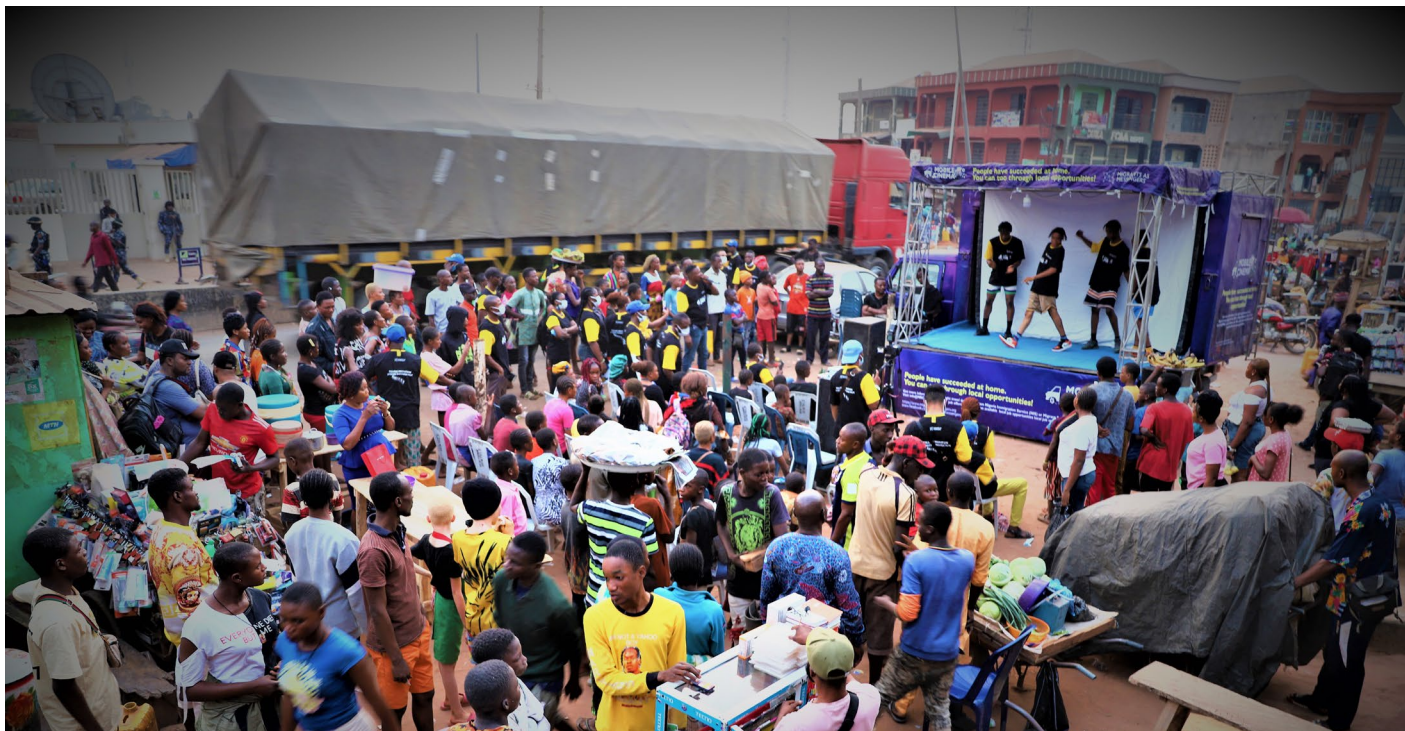
Mobile cinema performance at a community in Edo State