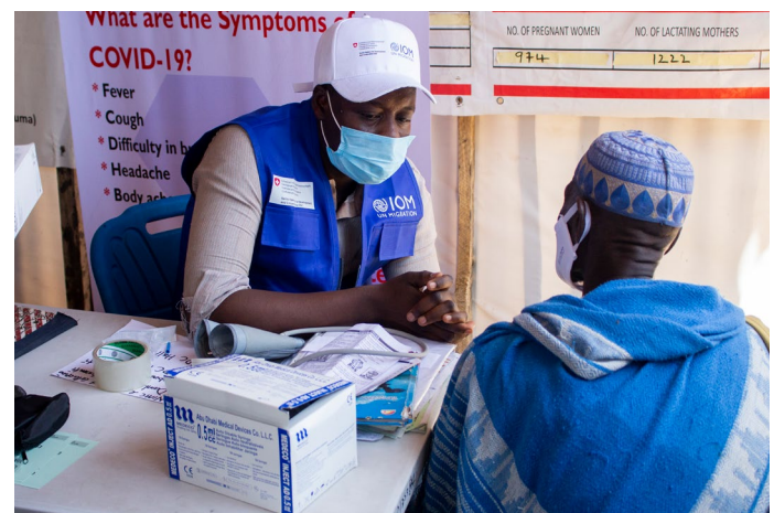
COVID-19 vaccination consultation for IDPs in Borno State @IOM 2022