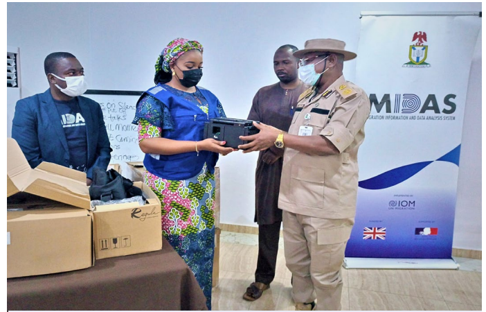
Handover of MIDAS devices to the Kano State NIS Command

A 5-day training was organized with NIS in Kano from 31 January to 4 February 2022, for 15 NIS ICT officers from the NIS Sokoto,