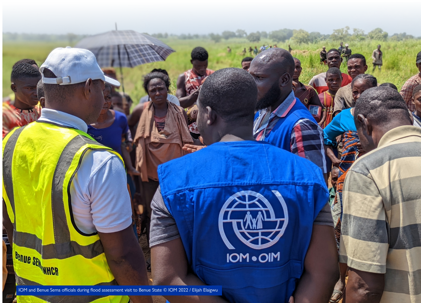
IOM and Benue Sema officials during flood assessment visit to Benue State