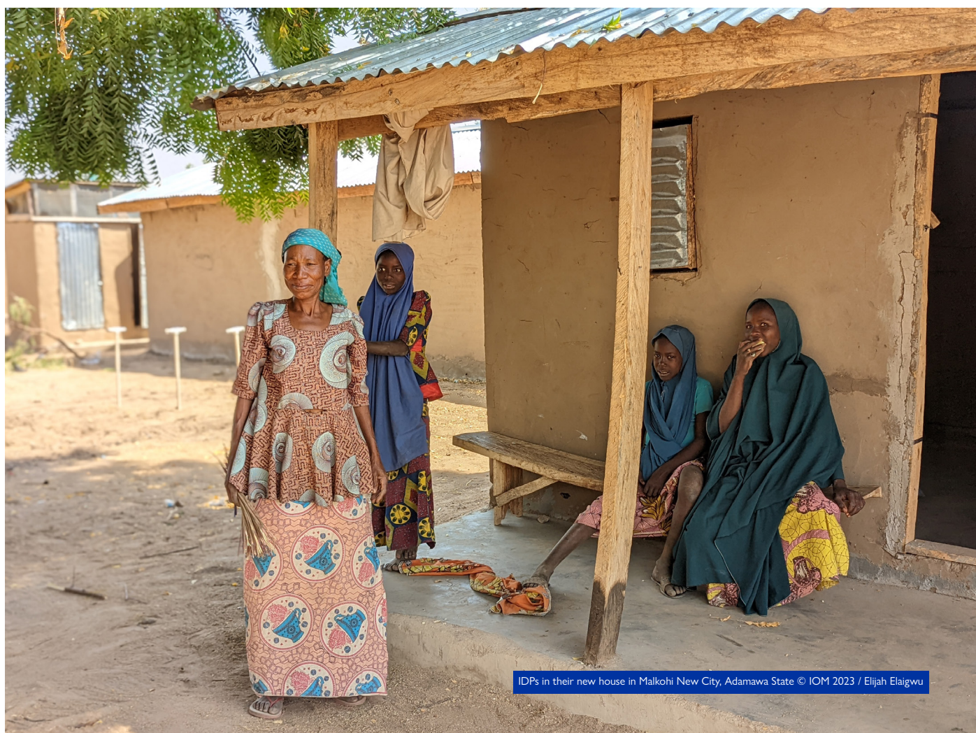
IDPs in their new house in Malkohi New City, Adamawa State

Voluntary: All relevant actors need to respect the right of IDPs to make an informed and voluntary choice on what sustainable solution to pursue and to participate in the planning and management of sustainable solutions. IDPs' decision-making on whether and when to return, relocate, or locally integrate will be devoid of any form of coercion or influence.