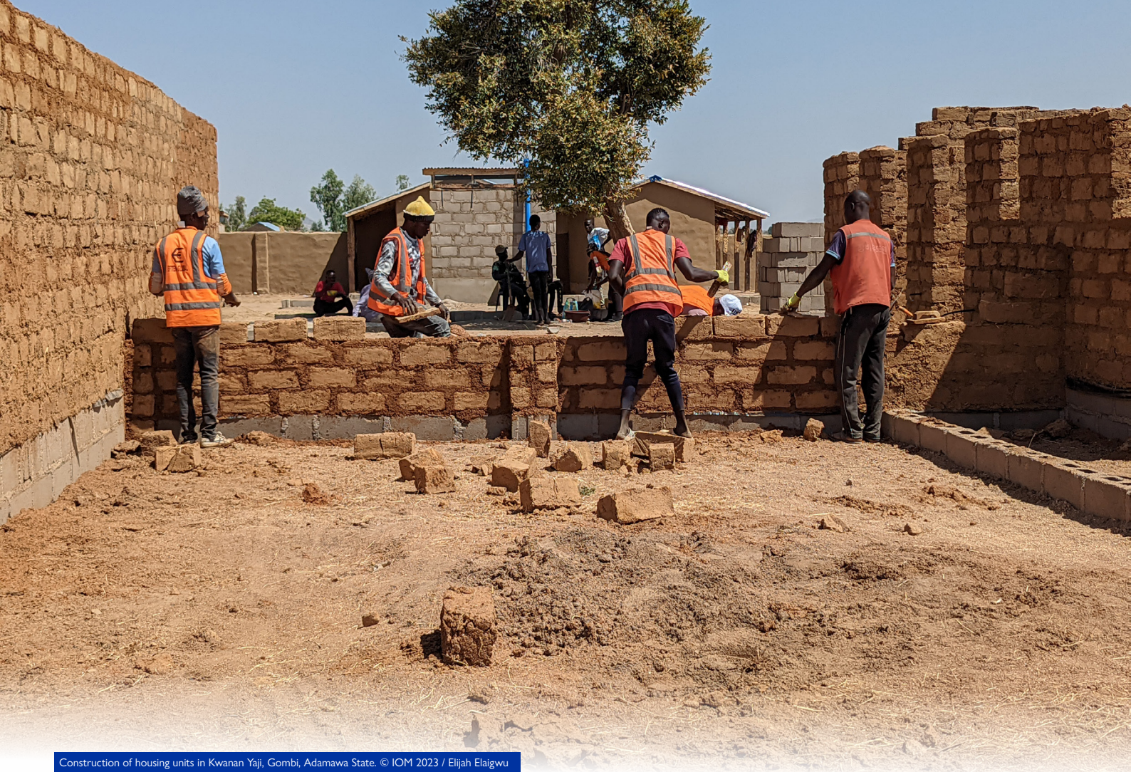
Construction of housing units in Kwanan Yaji, Gombi, Adamawa State.