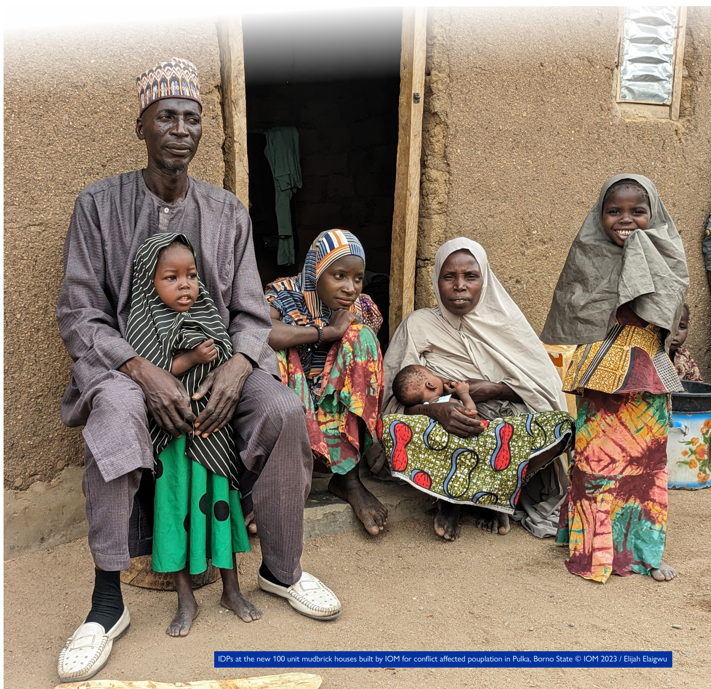
IDPs at the new 100 unit mudbrick houses built by IOM for conflict affected population in Pulka, Borno State