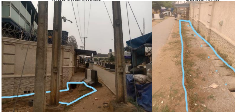
C. GRADIENT STABILIZATION AND DRAINING WITH PVC PIPES IS REQUIRED AT THESE SECTIONS